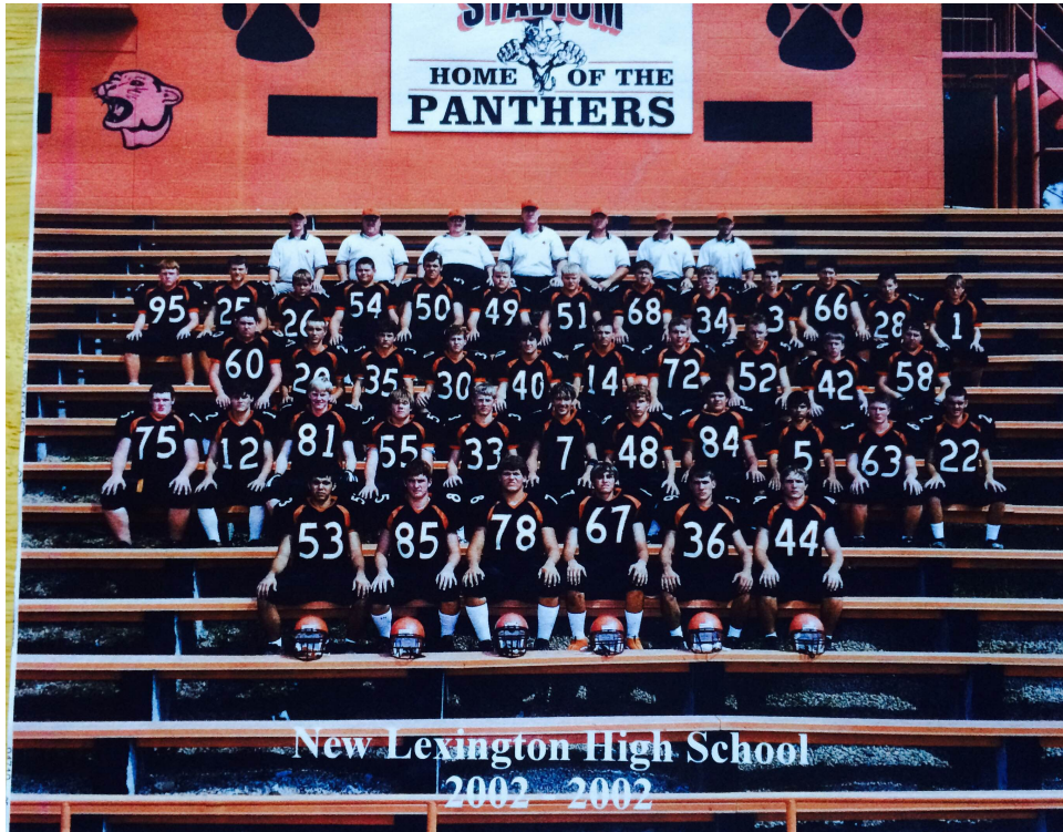
2002 Football Team

The 2002 NLHS football team finished the regular season undefeated with 10-0 mark. The victory over a Division I playoff team, Logan, (33-6) and their perfect record vaulted the Orange and Black to AP State Runner-Up Division IV and a #16 National ranking. The 2002 Panthers won the school's 18th MVL championship and made the fourth playoff appearance in school history.